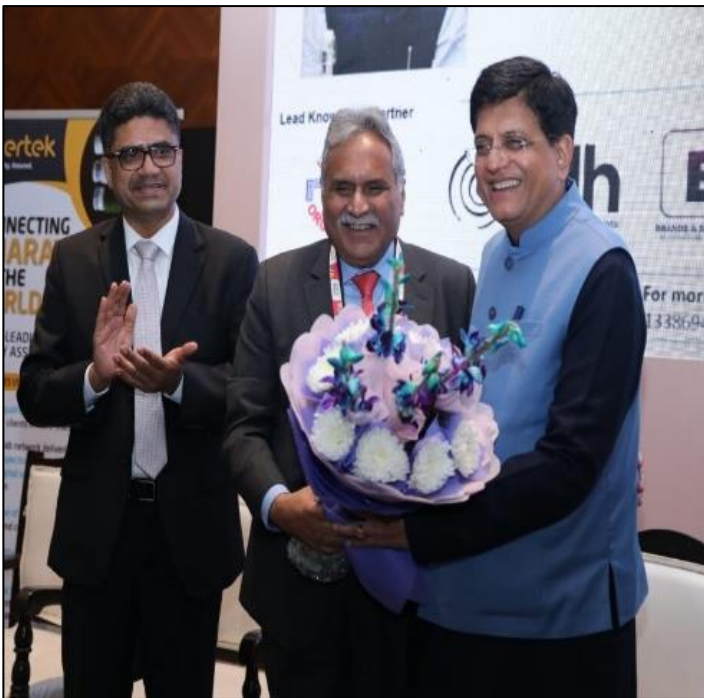
Shri Rakesh Mehra, Chairman CITI felicitating Hon'ble Minister of Textiles, Shri Piyush Goyal,

In his inaugural address, Shri Piyush Goyal complimented the exemplary service of all involved in the textile sector. Shri Goyal applauded CITI for their support and hard work and expressed confidence in helping the sector grow and provide employment and opportunities to the youth of the nation. He further emphasised on CITI's ability to serve not only the needs of the nation but the entire world. He thanked the CITI officials and conveyed his gratitude to the officials for their contribution towards the sector and for guiding the government to continue to grow the textile industry.