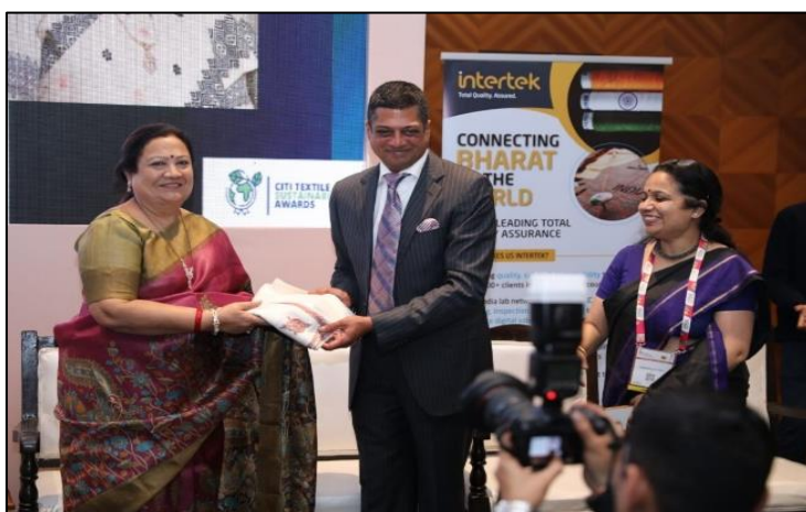
Shri Ashwin Chandran, Deputy Chairman CITI, felicitating Hon'ble Minister of State for Textiles and Railways Smt. Darshana Vikram Jardosh,

With a vision for India's growth and prosperity, the Hon'ble Minister urged stakeholders to work together with a national spirit, ensuring that the textile industry continues to represent the nation's identity and prowess globally, "Let's all work together in oneness and supporting each other with a national spirit and understanding different elements of value chain and making sure textile industry represent the face of India across the world", opined the Hon'ble Minister. He further said that the Bharat Tex 2024 event is a testament to the capability of the sector to be a leader in the future at a global stage. He expressed confidence that working together and understanding the elements of the value chain will help the textile industry be the driving force of the nation's GDP.