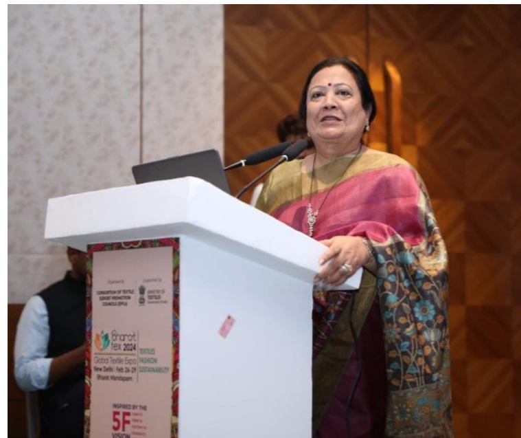
Hon'ble Minister of States for Textile & Railways delivering the Keynote address