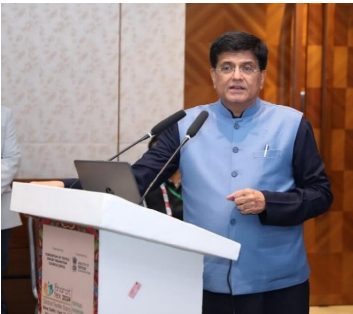
Hon'ble Union Minister of Textiles, Shri Piyush Goyal delivering the inaugural address

The event was inaugurated by Hon'ble Union Minister of Textiles, Commerce and Industry and Consumer Affairs, Food and Public Distribution, Shri Piyush Goyal, while Hon'ble Minister of State for Textiles and Railways, Smt. Darshana Jardosh delivered the Keynote Address during the event.